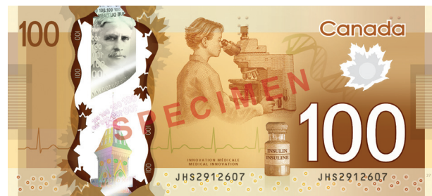
$100 reverse: Medical Innovation

denominations, the first two of which have already been made public and are reproduced below. Three more designs—“Canadian National Vimy Memorial,” “The Canadian ” train and “ Canadarm2 and Dextre ”—will be revealed when the $20, $10 and $5 denominations of the Polymer series are unveiled some months before each is issued through 2012–13.