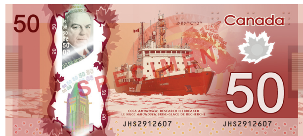
$50 reverse: CCGS Amundsen, Research Icebreaker

for telling their staff and customers about the new notes, and for returning notes of the previous series to the Bank of Canada. The Bank also sought technical advice from forensic experts at the RCMP. And finally, the Bank tested the public's willingness to accept a change to polymer: sample notes had an enthusiastic reception from participants in focus groups who found them modern, innovative and exciting.